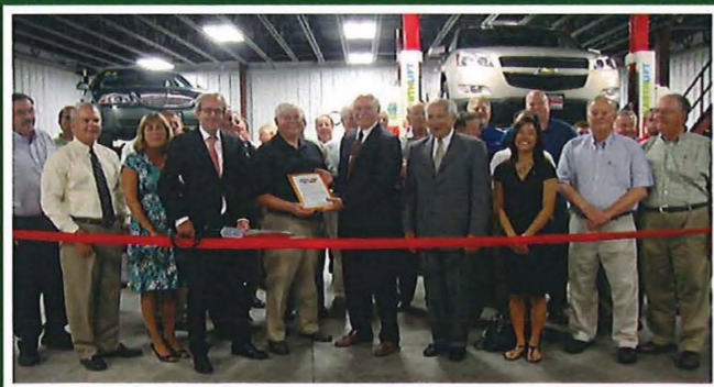
Stertil ALM Streator, IL