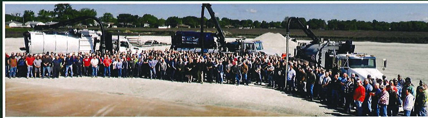
Vector Building Expansion Groundbreaking Ceremony.