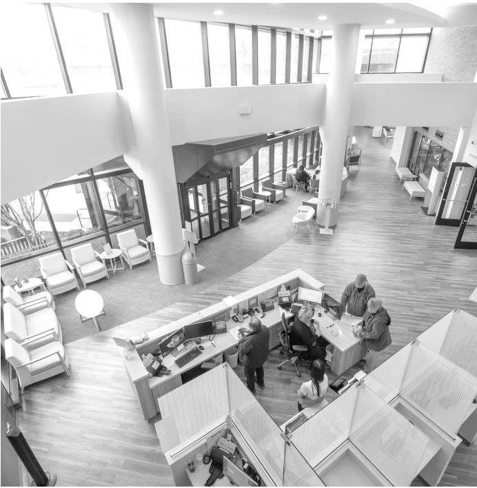
THE INCREASE IN COVID-19 NUMBERS has forced Morris Hospital, and all of its facilities, to return to its strict visitor guidelines – in an effort to keep patients and staff safe. Visit morrishospital.org/covid19 for the latest restrictions.

Follow Godley Park District on Facebook and visit their website, godleypark.com, regularly for updates.