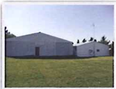
Back of Property