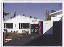
Front of Second Pole Building