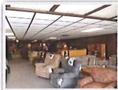
Inside Store Area